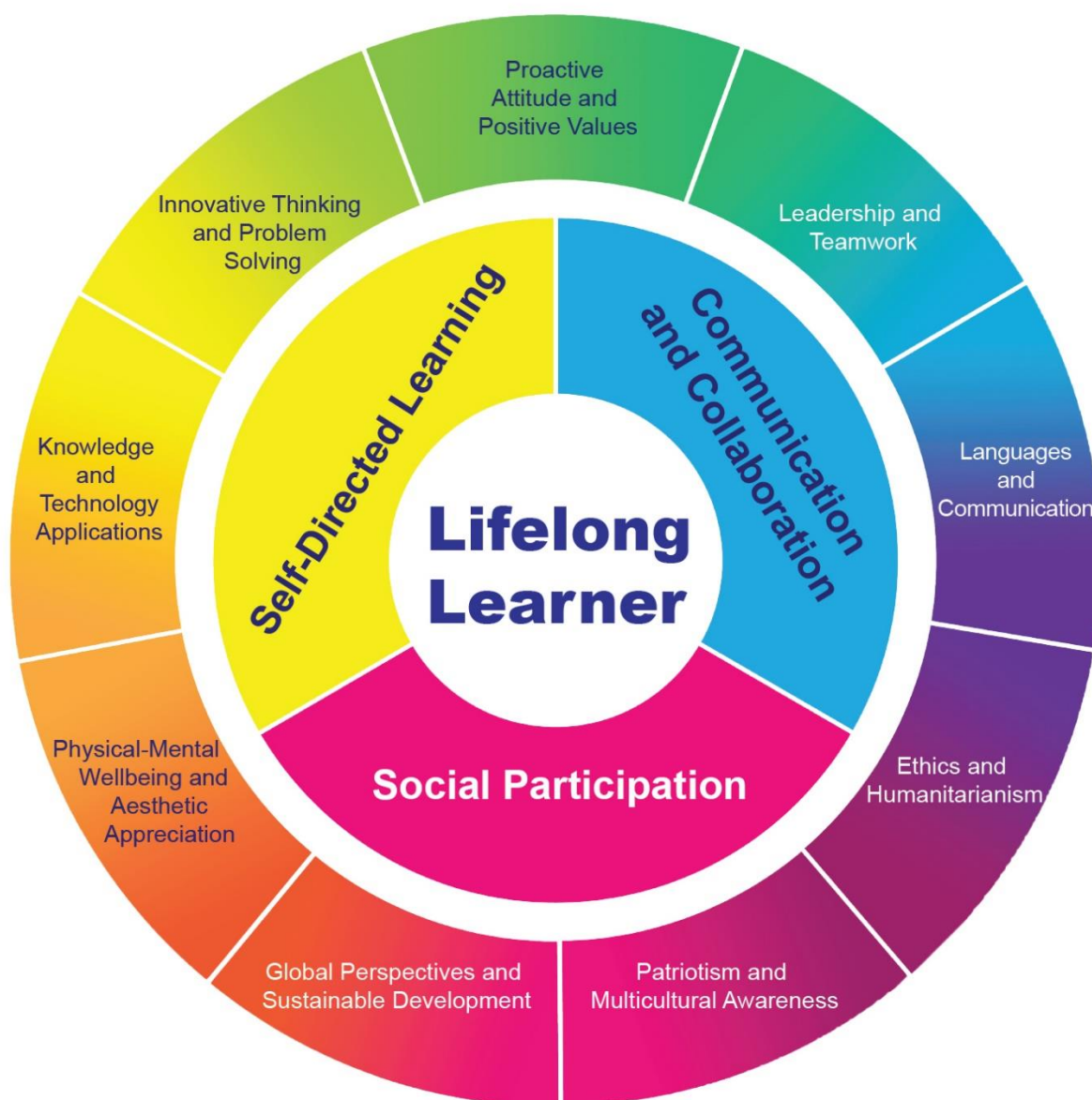
Figure 1: The Structure of Core Competencies

The core competencies emphasise on the comprehensive competencies and capabilities which include one's learned knowledge, capability as well as attitude. Table 1 presents the core competencies and their definitions (Senior Middle Level).